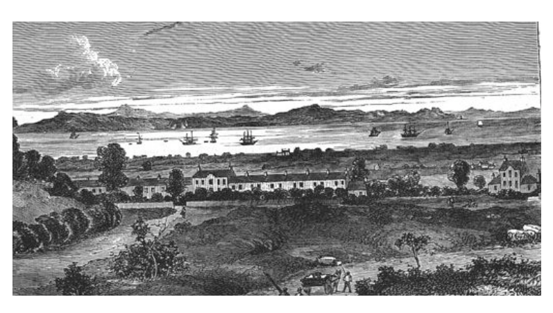
Drawing of 'Picardy Village and Gayfield House (After Clerk of Eldin)'

its rock, the various construction sites on the north side of the new bridge, the houses going up all along Princes Street and behind. It was borne in upon them how huge the changes were that had already taken place, and how, in time, all the fields and gardens as far even as the village of