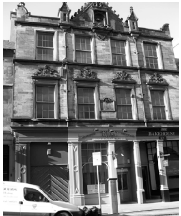
Time to give pigeons their marching orders

In Spurtle’s view, it is outrageous that a building of this distinction is being left to moulder. It is the only listed structure in Broughton St without occupancy or function. Privileged owners of major buildings have a responsibility not only to conserve but to utilise them in the interests of Broughton’s richly varied community. Privilege should not be considered as a right by owners to do what they like, which in this case appears to be nothing. Spurtle strongly supports the Scottish Civic Trust in bringing the plight of such an important building to wider attention. It is our fervent hope that No. 32a will be made safe and then imaginatively restored to Broughton without further delay.