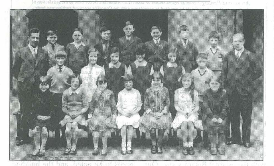
St. James' Episcopal School in Broughton Street, sometime in the 1930s - where the Stafford Centre is today.