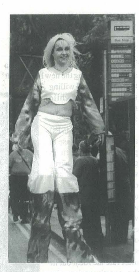
Walking tall on the Pride March

Safeguarding our architectural heritage Protecting the city's amenity