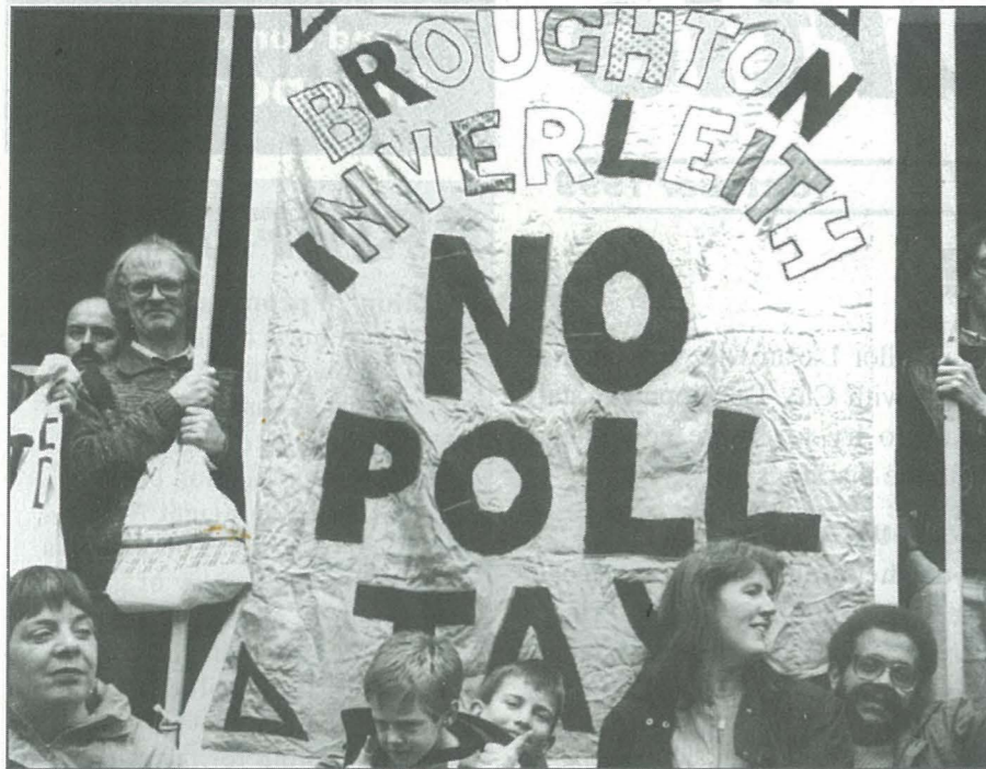
Our local Anti-Poll Tax Group outside the Scottish Office in the early 1990s.