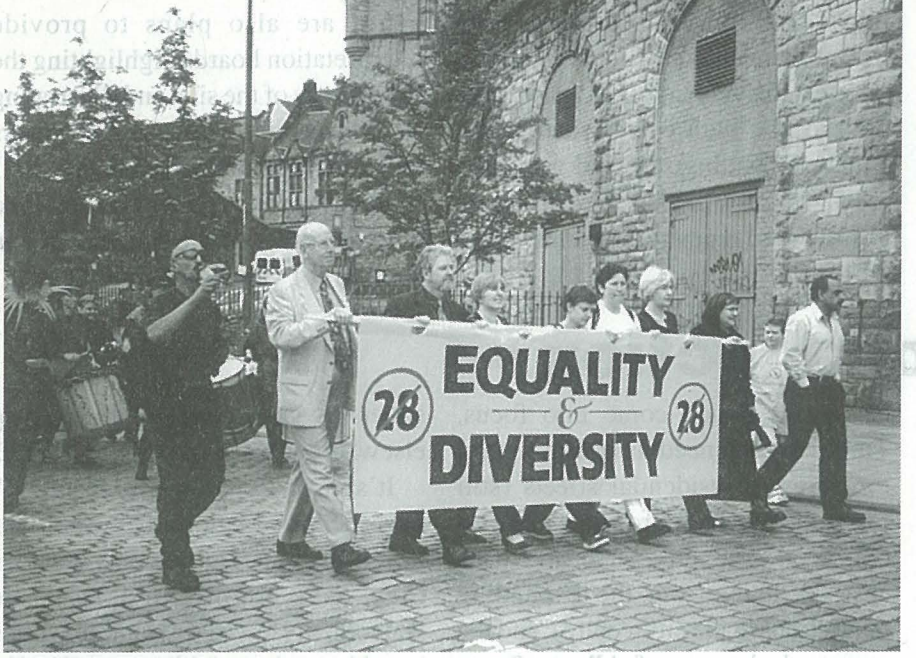
Saturday 24th June: Marchers celebrate the end of Section 28.

Street last week, as the Scottish Parliament did the people of Scotland proud by passing the final Public Life Bill.