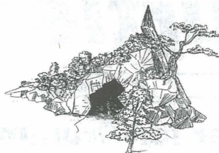
The Water Mountain planned for Scotland Yard

As its 15th Anniversary approaches, Scotland Yard Adventure Centre continues to be a hive of activity. Most visibly, the old Fort is coming down to make way for the Water Mountain.