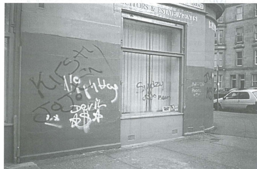
Graffiti: one issue for the new Broughton Village Association

But, mainly, the Association is about the benefits of the "village in the city". We live here because we want to; we know what it's like; the Association just wants to make it that bit better.