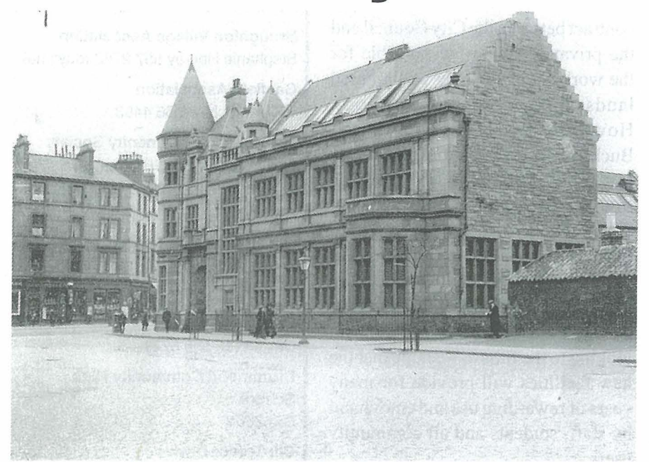
The public library in McDonald Road in 1904, the year it opened

building will be fully accessible, with floors and the installation of toilet and baby-changing facilities.