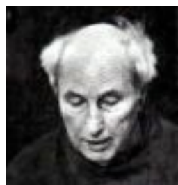
Robert Garioch 1909-81

Robert Garioch belongs to the glittering pantheon of 20th-century Scots vernacular poets which includes Hugh MacDiarmid, William Soutar and Sidney Goodsir Smith. Best known for his humorous and satirical poems which