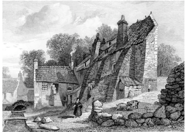
Old houses at Canonmills, by Daniel Wilson.

female servants – again I wonder whether they actually lived there. A spirit dealer and a cowfeeder (dairyman) catered for various needs of this community. Again we get a glimpse of their church-going habits. As with the people of Broughton, some had their children baptised in the parish church, some in Edinburgh or South Leith parish churches and two in secession churches. None of these churches were particularly convenient for people from Canonmills and it must have required a great deal of commitment to make the long uphill journey to attend the secession church in Bristo Street!