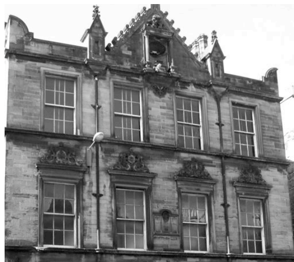
George Heriot District School opened in 1855. Taken over by the School Board around the time the poem was written, it closed a couple of years later – pupils transferred to the new London Street School.

Our local poet looked forward to the coming of electric street lighting to Broughton Street. It seems he/she had to wait some time for it. I haven’t found a date for its actual installation: but it wasn’t recommended by the relevant Council committee until January 1898!