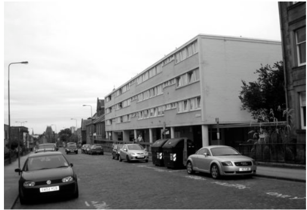
Today's Claremont Court stands on the site once occupied by M'Dougall's

Three weeks before the London premises and warehouses of M'Dougall's had been destroyed by enemy action. Much of the machinery lost in the 1941 fire in Edinburgh was irreplaceable in wartime. The stock of printing plates and electros was however, stored elsewhere, and by a happy