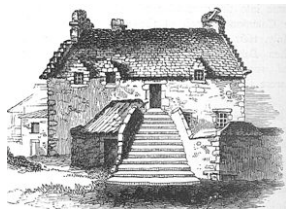
Broughton Tolbooth 1582–1829