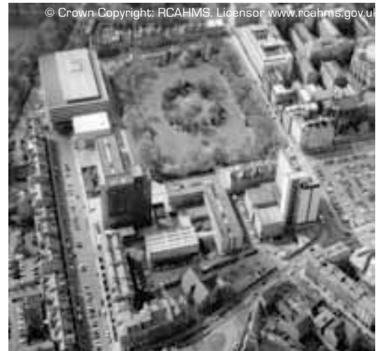
UNIVERSITY OF EDINBURGH, GEORGE SQUARE