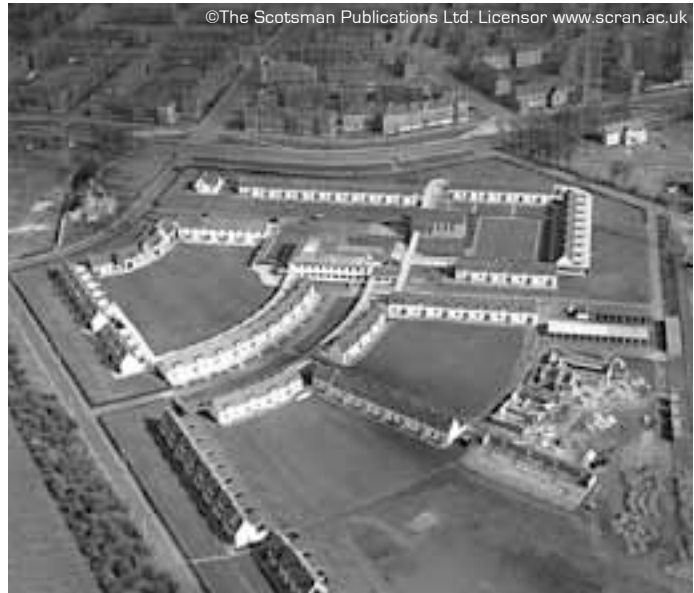
THISTLE FOUNDATION, LORIMER & MATTHEW (NO.1)

special architectural or historic interest is of definite architectural quality. The listing of buildings less than 30 years old requires exceptional rigour because there is not a long historical perspective and they will normally only be considered for listing if found to be of national significance and/or facing immediate threat.