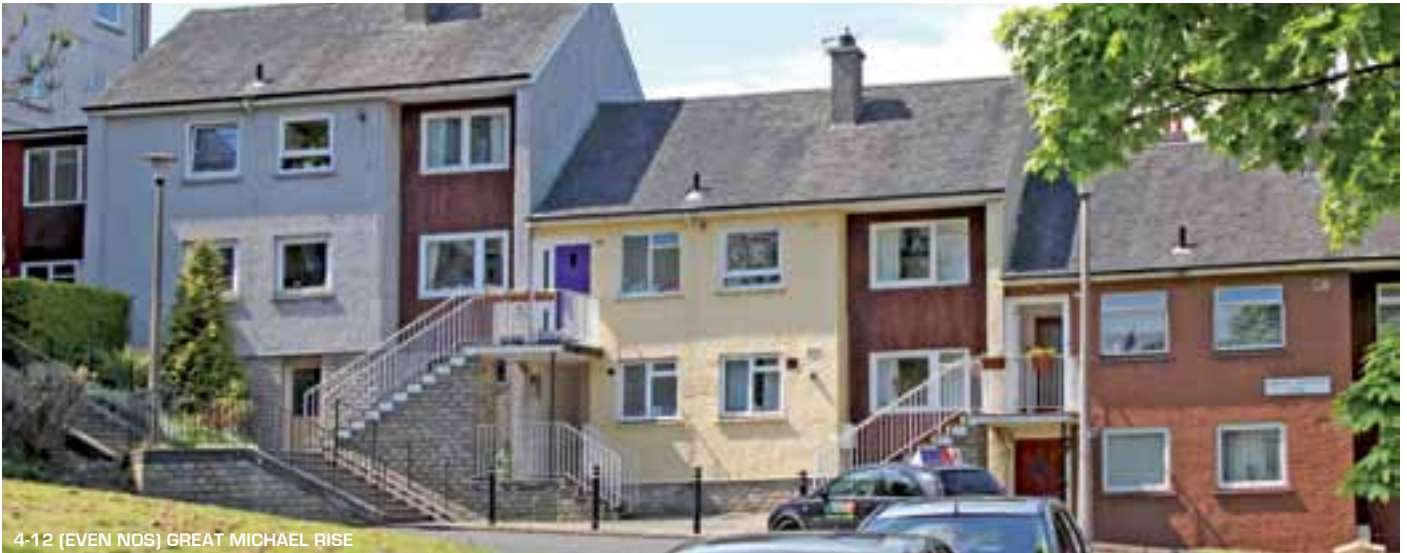
4-12 (EVEN NOS) GREAT MICHAEL RISE