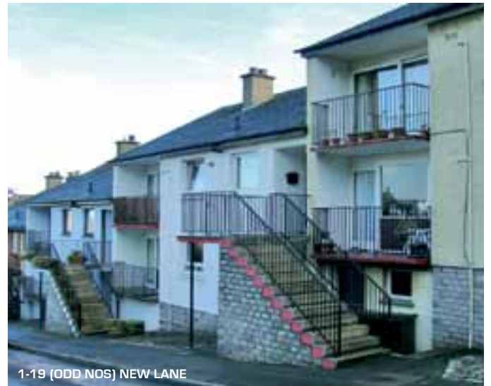
1-19 (ODD NOS) NEW LANE