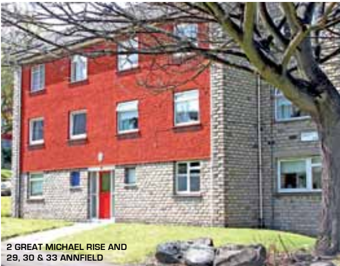
2 GREAT MICHAEL RISE AND 29, 30 & 33 ANNFIELD