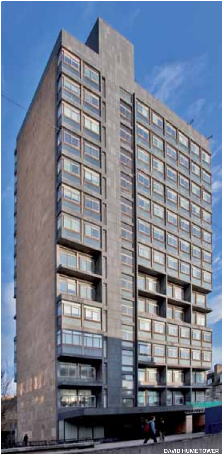
DAVID HUME TOWER

ARCHITECT Robert Matthew, Johnson-Marshall and Partners