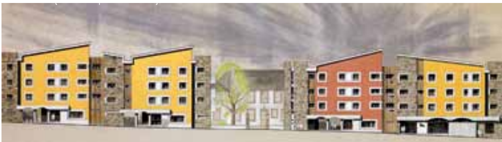
CANONGATE FLATS, BASIL SPENCE, GLOVER AND FERGUSON (NO.29)

The three listed telephone exchanges from this period are representative of the technological innovations which were being made in the post-war period, and each example demonstrates the combination of up-to-date technology and represent forward-thinking design from the 1940s through to the 1960s.