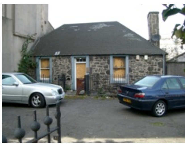
'Botanic Cottage may be one of the earliest and most neglected buildings on Leith Walk, but a local community group is launching an ambitious project to save it.'

No. 23 Summer 2008: 'Broughton History in the News – Botanic Cottage press release..... The Friends of Hopetoun Crescent Garden has received £48,500 from the Heritage Lottery to fund