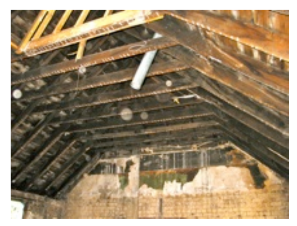
'The house still has its 18th century roof, with the original timber of a high coved ceiling discovered in the lecture room on the first floor.'

an archaeological record of the historically significant cottage which lies between Annandale Street and McDonald Road.'