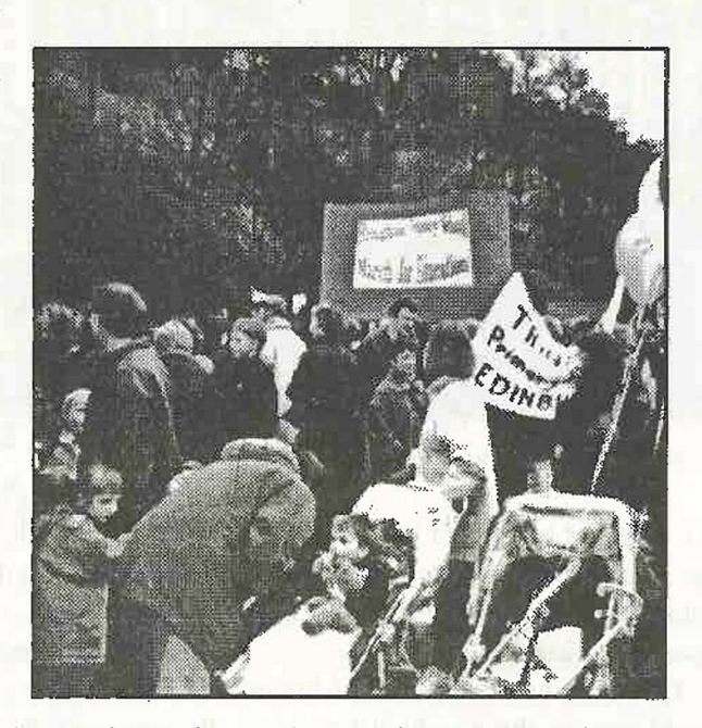
'March for Education' - Broughton Primary's banner