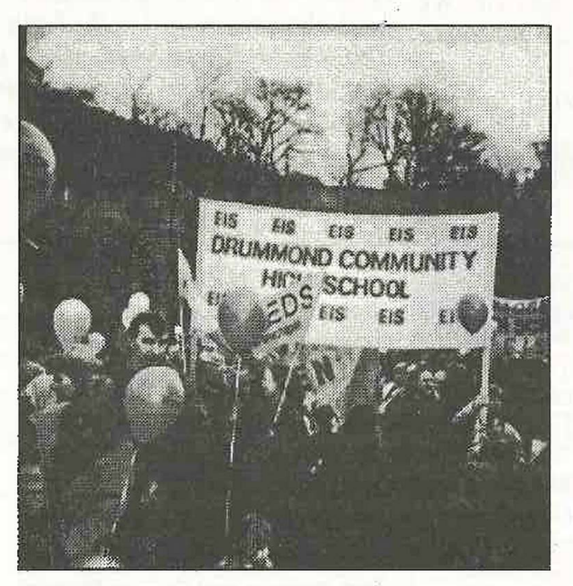
Marchers assemble at Waterloo Place

The size of the march showed just how strong the feeling against this attack on our children's education is. But to force the Government to have second thoughts the pressure must continue. If you haven't already done so, write to your MP, Malcolm Chisholm - 274 Leith Walk, EH6 5EL. And to Michael Forsyth MP, Secretary of State for Scotland, St Andrews House, EH1 1DG.