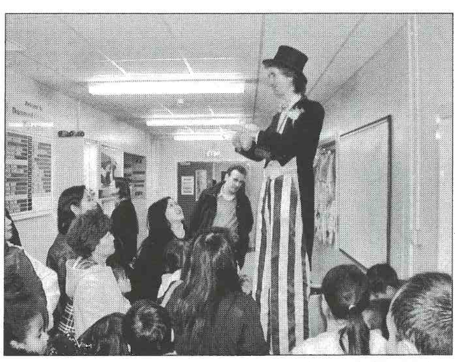
Drummond Community High School held its sixth annual 'Festival of Learning' on 12th March. A free event for the whole school and local community, there were adult education 'taster' workshops, exhibitions, live music and stage performances.

'There is a decent green open space planned between the east block and the west block fronting on to the north side of Hopetoun Street, but it is not equivalent to the space that the old allotments once used. We've not achieved what the Action Plan is expecting. But only part of the northern building zone has come forward for development – so there is still time. We will need to keep an eye on things and make sure we get the green space there that we need. To be honest, I don't know if we can now deliver the exact equivalent of what was there in the old allotments. But we will try to make sure that there is the right amount of good quality usable community and private green space to serve the needs of the current and future residents.'