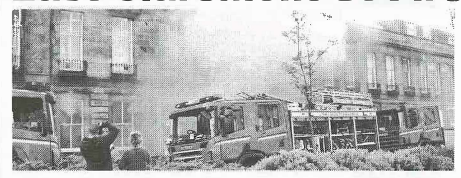
A serious fire has damaged the interior of the Town House B&B at 53 East Clarement Street.

The blaze broke out in the basement at around 6pm on 22nd May and within minutes 6 pumping appliances were on the scene at the listed building. Teams of firefighters wearing breathing equipment searched the smoke-filled basement and 3-storeys for people trapped inside. Fortunately it emerged that the building was empty and there were no casualties. The fire was under control by 9.40pm, although a tender remained overnight in case of reignition.