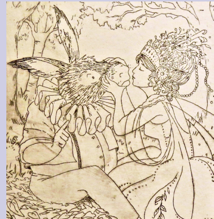
Detail from 'Thou art translated'.