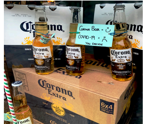
Image shows Vino display on Broughton St.

A lot has changed since the sudden arrival of Coronavirus and its imminent spread across Edinburgh. The scale and seriousness of fast-changing news has inevitably overtaken our coverage in these pages. Dates and timings reported here are very likely to change.