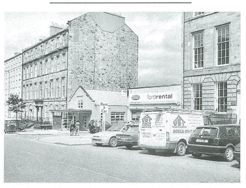
At the other end of Annandale Street Lane, there's a plan to demolish two low-rise buildings and build a block of 16 flats across the opening – with a pend into Annandale Street (Planning Application Ref. No. 06/02522/FUL). Street residents have voiced concerns about parking, and about the pend construction blocking daylight; but the main objection is that the proposed roof and frontage design do not blend with the adjacent Georgian tenements.

In addition to the usual drawings, which can be found in the Planning section of the City Council's website (Ref. No.06/03443/FUL), the developer has a model of the proposed new building – which the Friends hope to have on display at their forthcoming AGM.