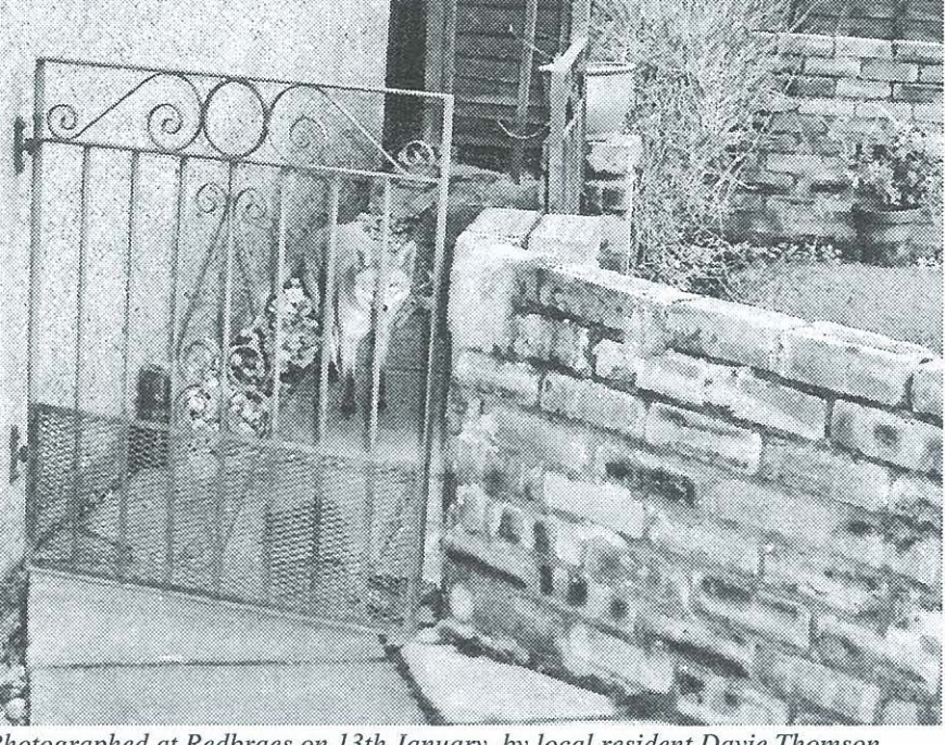
Photographed at Redbraes on 13th January, by local resident Davie Thomson

In the past we've reported on various and cannot overpopulate, but will advise the use of Renardine, a strong around the garden on rags, as a fox deterrent. If foxes are fouling your difficult to control. Some cities have sand and Renardine on top of it - if