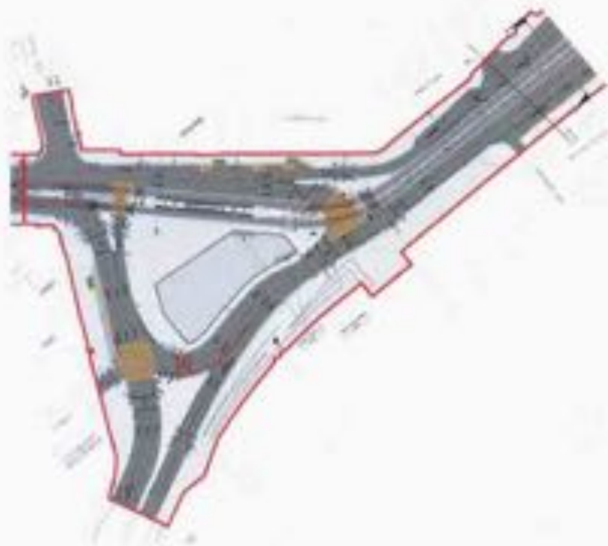
Figure 6 - Prior Approval drawing for Picardy Place