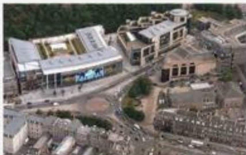
Aerial View of Picardy Place / Leith Street - 2008