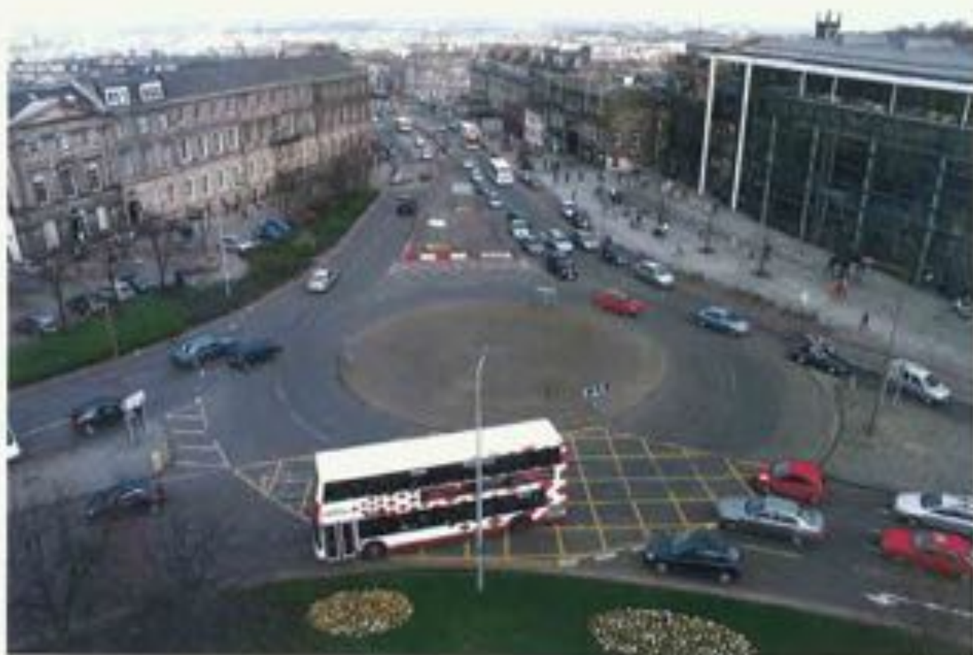
Aerial View of Picardy Place / Leith Walk