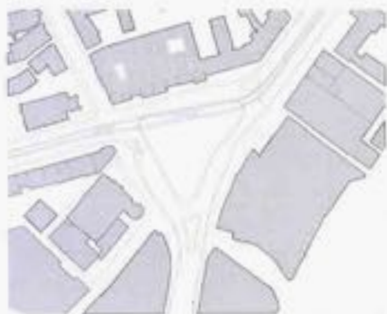
Figure 10: Emerging Context