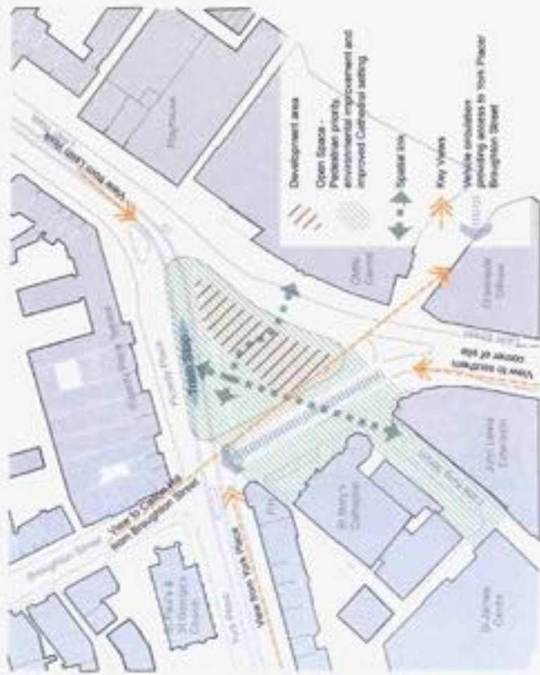
Figure 13 Development Opportunity and Public Space