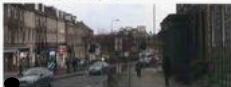
View from York Place

The view from York Place to the west is framed by the strong horizontal lines and distinctive character of terraced properties on York Place. To the north the elegant St. Paul & St. George's Episcopal Church provides relief and marks the junction with Broughton Street immediately beyond. The Picardy Place terrace continues the street edge, stepping down the hill. On the south side of York Place the terraced properties end at Broughton Street, acknowledged by the canted bay of the 19 th century pub that terminates the terrace. Beyond, the landscaped area at Picardy Place, the Playhouse Theatre and Baxter's Place, stepping down Leith Walk, come into view. Figure 5 on page 4 shows the importance of this building line