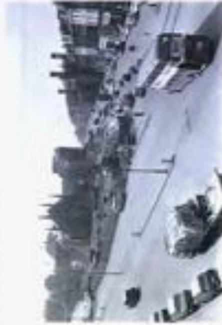
Figure 3 – Photograph of the site – early 1930's