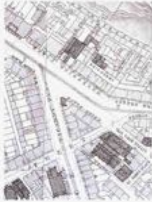
Figure 2 – Historic context