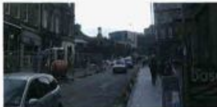
View from Broughton Street

Broughton Street rises as it approaches its junction with Picardy Place. The view here is of the modern Greenside development beyond, framed by the terraces that step up on both sides of the street and by the rounded corner building to the east on the corner of York Place. On arrival at the top of the street views open up to reveal Calton Hill and its monuments, seen above the Omni Centre and the prow of the John Lewis department store stepping up Leith Street. The gap between the Greenside and Omni Centre buildings mark the presence of a route onwards towards Calton Hill.