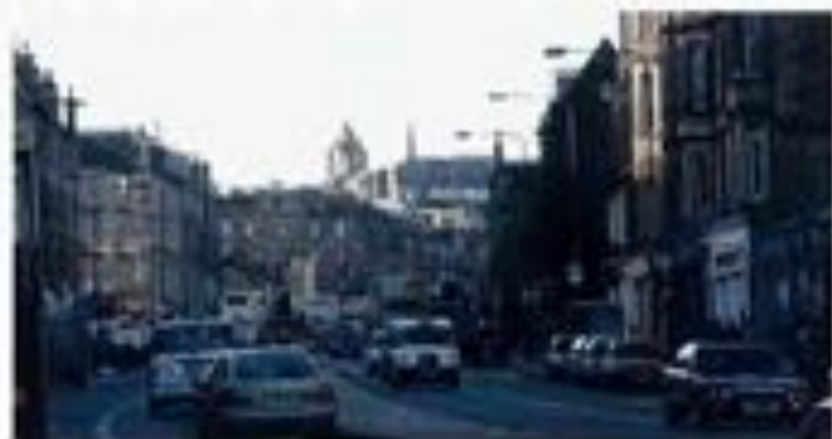
View from Leith Walk at Piling Street

An important approach to Picardy Place is from the north-east along Leith Walk, a main traffic artery to Leith and the waterfront, and the route of the tram. Picardy Place is situated at a point of arrival to the city centre from this direction and is an important 'gateway'. Currently the view on approach is dominated by the uncompromising bulk of the St James Centre sitting at the top of the hill, dwarfing the cathedral buildings and the lower John Lewis extension in the foreground.