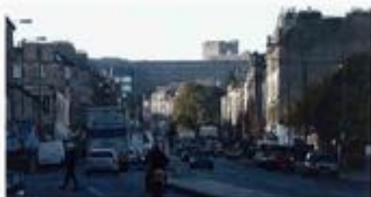
View from Leith Walk at Brunswick Street