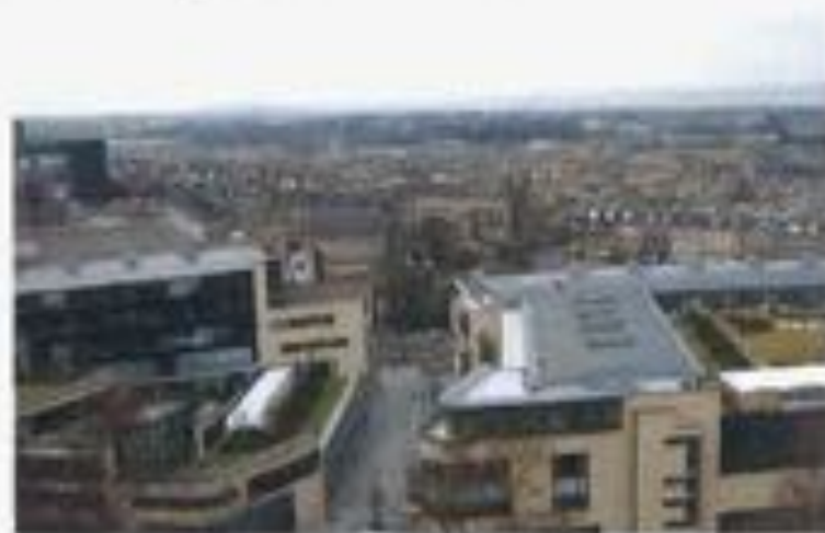
View from Calton Hill

The view from Calton Hill is composed of the landscaped roofs of the Greenside developments in the foreground and the gap between the two buildings providing a glimpsed view of the landscaped space to the front of the cathedral. Both the cathedral and in particular St. Paul's & St. George's church are important elements in this view.