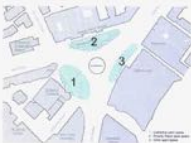
Figure 8: Current Context – Existing Open Space

by traffic and difficult for pedestrians to navigate. The tram proposals and reconfiguration of road space present an opportunity to build upon this initiative, reconfigure road space and create development opportunities.