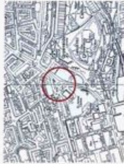
Figure 1 – Study Area