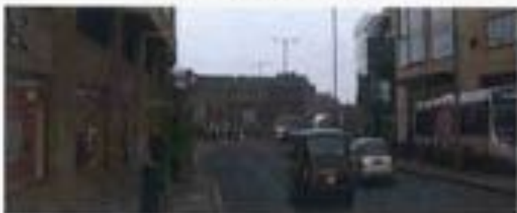
View looking north from Leith Street

Descending Leith Street from Princes Street the eye is led around the curve of the street by the strong sweeping line of the glazed façade of the Omni Centre to the east. The west side of Leith Street turns the corner at the John Lewis department store extension to take up the line of Broughton Street. The only clue to the continuation of this important urban corridor is the Picardy Place terrace turning the corner to align itself with Leith Walk in the distance. Historically the building line of the demolished tenement block followed the Leith Walk / Little King Street axis, rather than the Leith Street axis, and resulted in an area of open space at the southern corner of the site (see figure 12)