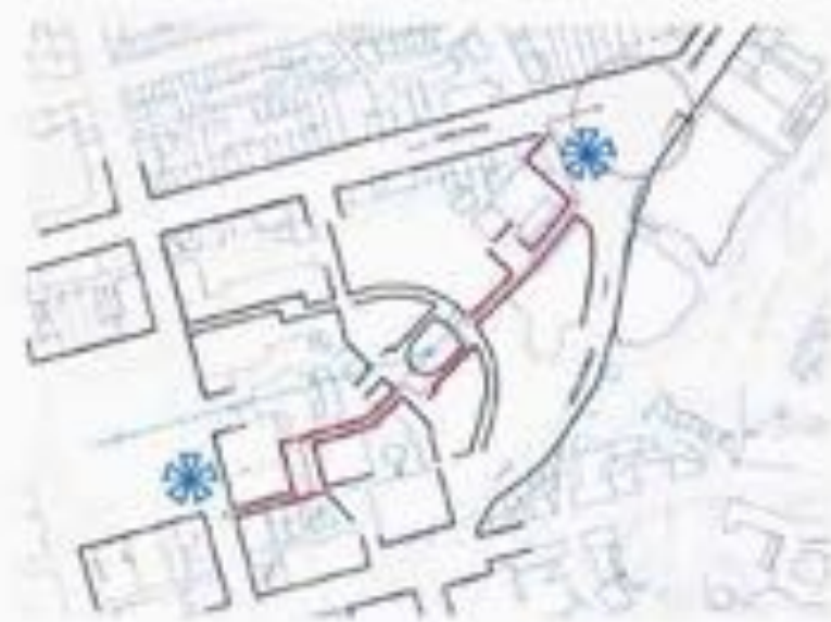
Figure 9: S/JQ Masterplan east-west route