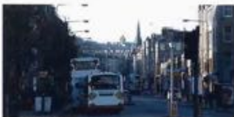
View from foot of Leith Walk