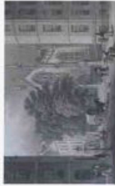
Figure 4- Etching – Historic view to Cathedral – the building to the right is near the Curran Doyle Plaza. The building to the left is the corner of the demolished Picardy Place block.