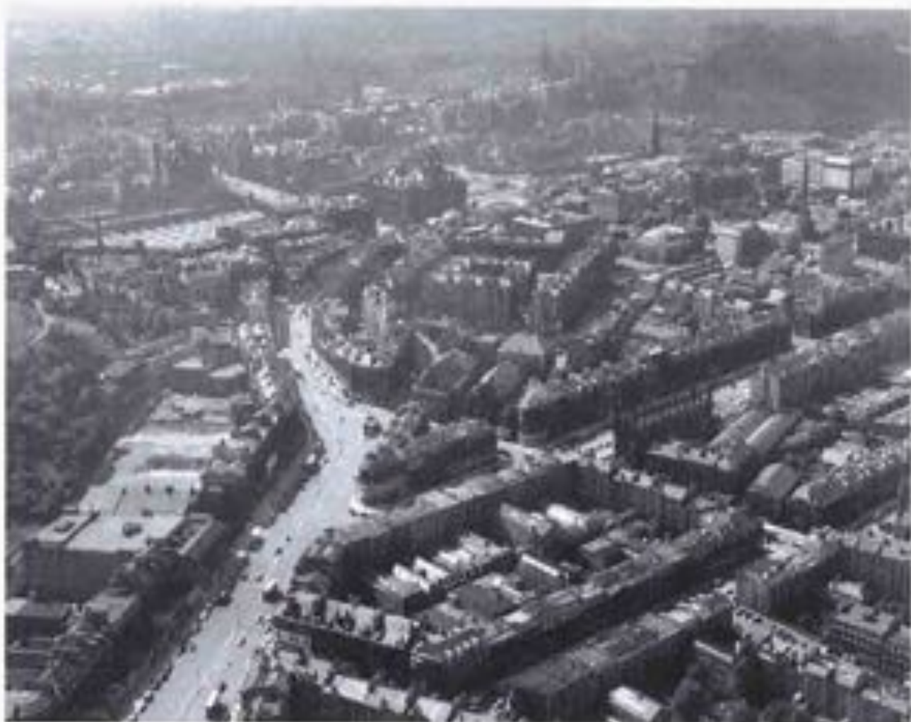
Figure 5 - Aerial view taken in the 1950's