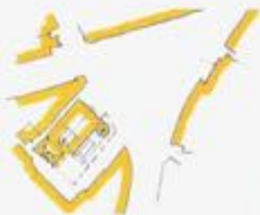
Figure 7: Urban edges and Enclosures